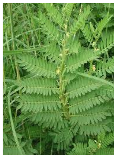
Figure 2: Plant of Cassia nigricans Vahl

Cassia nigricans Vahl, also known as Chamaecrista nigricans (Vahl) Greene, is called Jiwo Tsamiya or Shuwakan Gargari . It's a woody herbaceous annual herb, or under shrub, between 1.22 and 1.52 m high with small yellow flowers. It is widespread in tropical Africa, including Nigeria, Arabia and India. It has brown, hairy pubescent