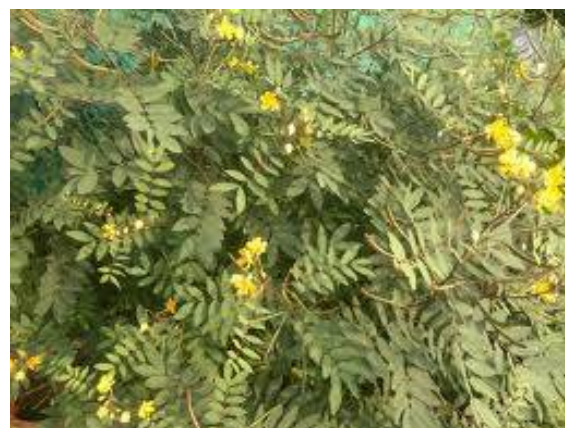
Figure 6: Plant of Plant of Cassia occidentalis L

Cassia occidentalis L is commonly called Kasondi in India. It is an Ayurvedic plant with huge medicinal importance (Raghunathan and Mitra, 1999). It is a diffuse offensively odorous under shrub. The plant is distributed throughout India. The plant is sub glabrous, leaflets 3-5 pairs. Flowers are yellow, in short peduncled few flowered racemes; fruits cylindrical containing 20-30 seeds (Figure 6).