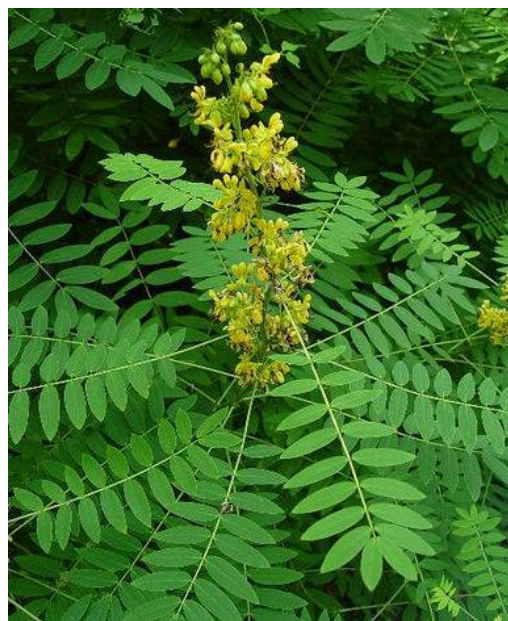
Figure 3: Plant of Cassia angustifolia Vahl

Cassia angustifolia Vahl commonly known as 'senna' is one of the medicinally important, drought-resistant shrub. It is a native of Saudi Arabia and has been naturalized in India. Cassia angustifolia is a small shrub with pale substrate or obtusely angled or ascending branches. Leave usually 5-8 leaflets overall, lanceolate, glabrous, axillary erect. The flowers are in blossoms, big in size and yellow colored. The pods are 1.4 to 0.8 in wide, greenish brown contain 5-7 obovate dark brown and smooth seeds (Figure 3).