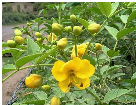
Figure 7: Plant of Cassia sophera

pinnately compound. Flowers are yellow colored (Figure 7).