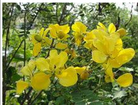
Figure 5: Plant of Cassia auriculata L

Cassia auriculata commonly known as Tanners senna is distributed throughout hot deciduous forests of India and holds a very prestigious position in Ayurveda and Siddha systems of medicine. It is profusely branched, tall, evergreen shrub generally 1.2-3.0 m in height. It is a common plant that flowers with large bright yellow flowers throughout the year. The leaves are alternate, stipulate, very numerous, closely placed, slender, pubescent. Leaflets 16-24, very shortly stalked 2-2.5 cm long 1-1.3 cm broad. The fruit is a short legume, 7.5-11 cm long, 1.5 cm broad, pale brown. 12-20 seeds per fruit are present each in its separate cavity (Figure 5).