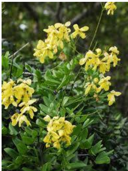
Figure 1: Plant of Cassia fistula L