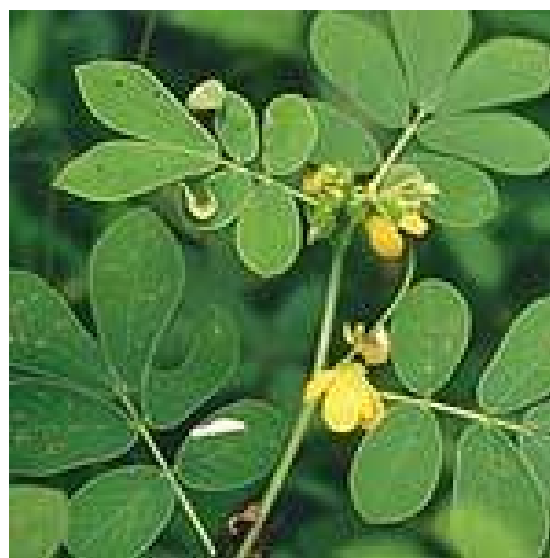
Figure 4: Plant of Cassia tora Linn

almost an under shrub about 30-90 cm high with pinnate leaves. Leaflets are in three pairs, opposite, obovate and oblong. Flowers are in pairs in axile of leaves with five petals and yellow colored. Pods are somewhat flattened or four angled 10-15 cm long and sickle shaped. The seeds are 30-50 in a rhombohedral pod. (Vaidya, 1994) (Figure 4).